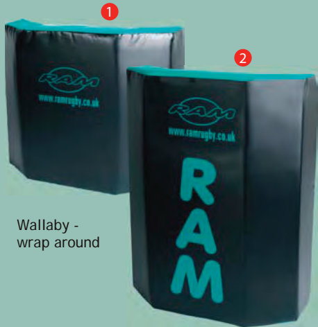
Wallaby - wrap around

Manufactured from a one-piece high density foam with durable PVC covering.