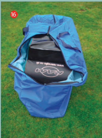
Carry bag to take 6 single wedge contact pads ▲