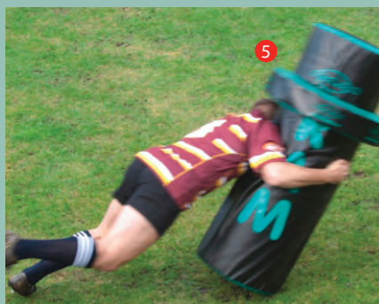
← The Ram Ridge

The ridge is slipped on to existing 14", 16" or 18" diameter tackle bags and then positioned on the bags to suit.