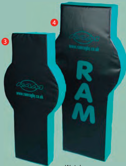
Watch - the very best protection for elbow and legs

For all these models allow up to 4 weeks delivery.