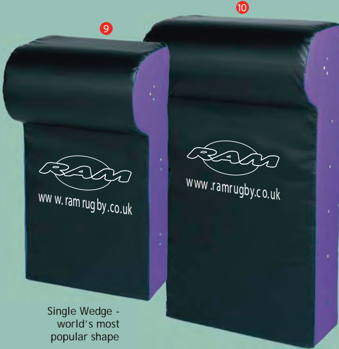
Single Wedge - world's most popular shape

GREAT PRICES & IMMEDIATE DELIVERY AVAILABLE ON SINGLE WEDGE & DOUBLE WEDGE CONTACT PADS