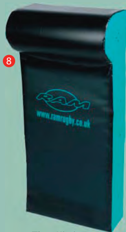
The 'Kiwi' Extended