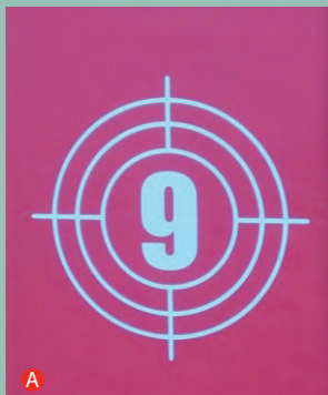
A Scrum-half target